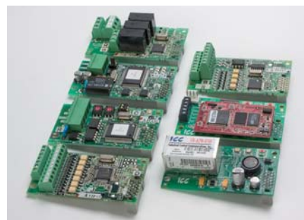
Option cards for additional functions

Functions can be added with option cards and additional I/O modules to configure the system for individual applications and requirements.